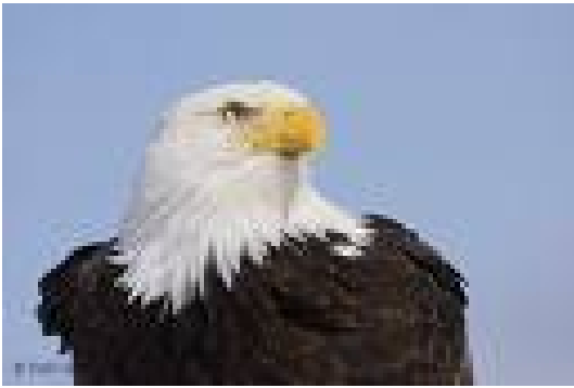
The Bald Eagle