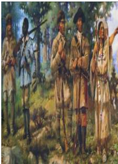
Meriwether Lewis and William Clark with Sacagawea